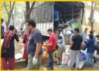
Go Green Environment Care