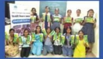
Smart Dot Project biodegradable sanitary napkins