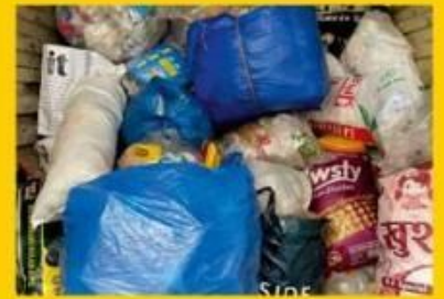
My plastic waste is my responsibility campaign