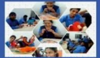
Aged and Differently Abled

We appeal our patrons to donate Note Books & Long Books during our Drives for School Children from Shahpur, Palghar-Wada, Vikramgad Villages.