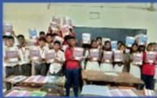
Dyanyadnya Education Project